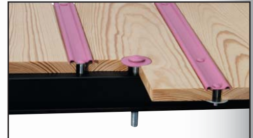
Steel Bed Strips and Zinc Plated Bolt Kit Pine Wood with Standard Mounting Holes