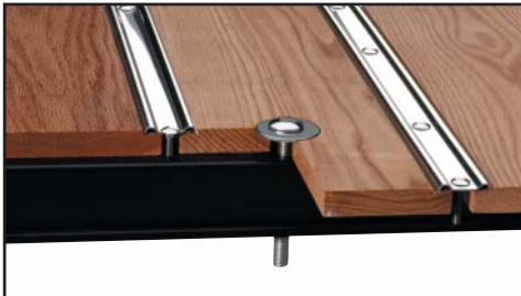
Polished Stainless Bed Strips and Bolt Kit Oak Wood with Standard Mounting Holes

Include bed wood boards with mounting holes; bed strips; and the bolts, nuts, washers and lockwashers (including angle strip bolts) needed to install the wood and strips. Choose from a wide variety of different wood/metal combinations to suit your style! For our oak kits, we select and machine oak bed wood from the finest quality Appalachian red oak lumber (show quality). The polished bed strips are precision roll formed and polished to a mirror finish in our own manufacturing shop. The oak/polished stainless kit includes brightly polished stainless bolts and offset washers. Or, select hidden mounting holes in the oak wood, with polished stainless or your choice of three types of anodized aluminum bed strips with hidden fasteners, and the bed-to-frame and angle strip bolts are included. For daily driver use, choose our southern yellow pine wood with steel bed strips and zinc plated bolts to be painted before installation like the originals. MAR-K now offers exotic wood! See pages 16 and 17 for a full listing.