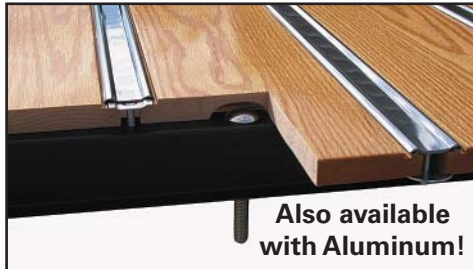
Polished Stainless Bed Strips, Hidden Fasteners Oak Wood with Hidden Mounting Holes