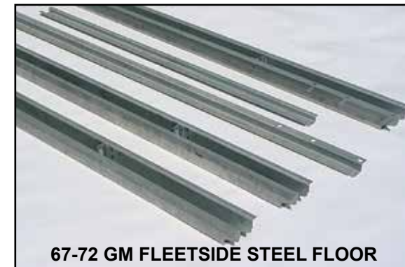
67-72 GM FLEETSIDE STEEL FLOOR

STEEL FLOOR CROSS SILLS - MAR-K™ also makes cross sills for the steel floor trucks. Each sill is specially designed to fit like original, including size, shape and hole pattern. The mounting bolt bracket is welded in place like original. Made of 14 gage electro-galvanized steel in Oklahoma City, USA.