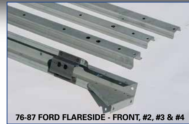
76-87 FORD FLARESIDE - FRONT, #2, #3 & #4

Made to bolt the rear cross sill to the bed sides, the GM and late Ford kits use 5/16" indented hex head bolts (shown at left) and the early Ford kit uses 1/4" hex head bolts. Nuts and washers included. The bolts which mount the rear cross sill to the bed strips are not in this kit. These are in the bed bolt kit or sold separately.