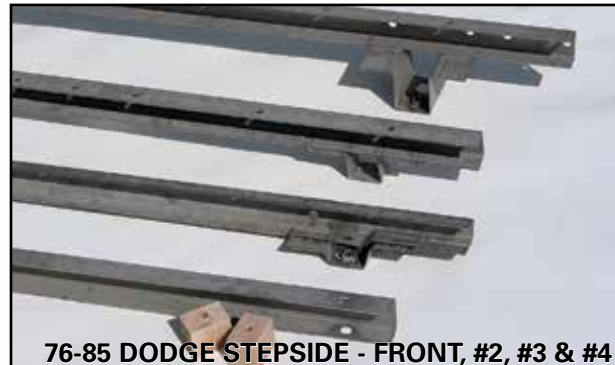
76-85 DODGE STEPSIDE - FRONT, #2, #3 & #4