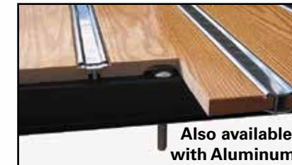
Polished Stainless Bed Strips, Hidden Fasteners Oak Wood with Hidden Mounting Holes