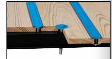
Steel Bed Strips and Zinc Plated Bolt Kit Pine Wood with Standard Mounting Holes