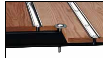
Polished Stainless Bed Strips and Bolt Kits Oak Wood with Standard Mounting Holes

MAR-K™ Bed Wood Kits are MADE IN THE USA!